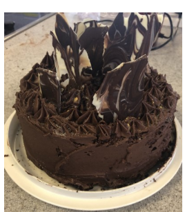
Well done Year 10!