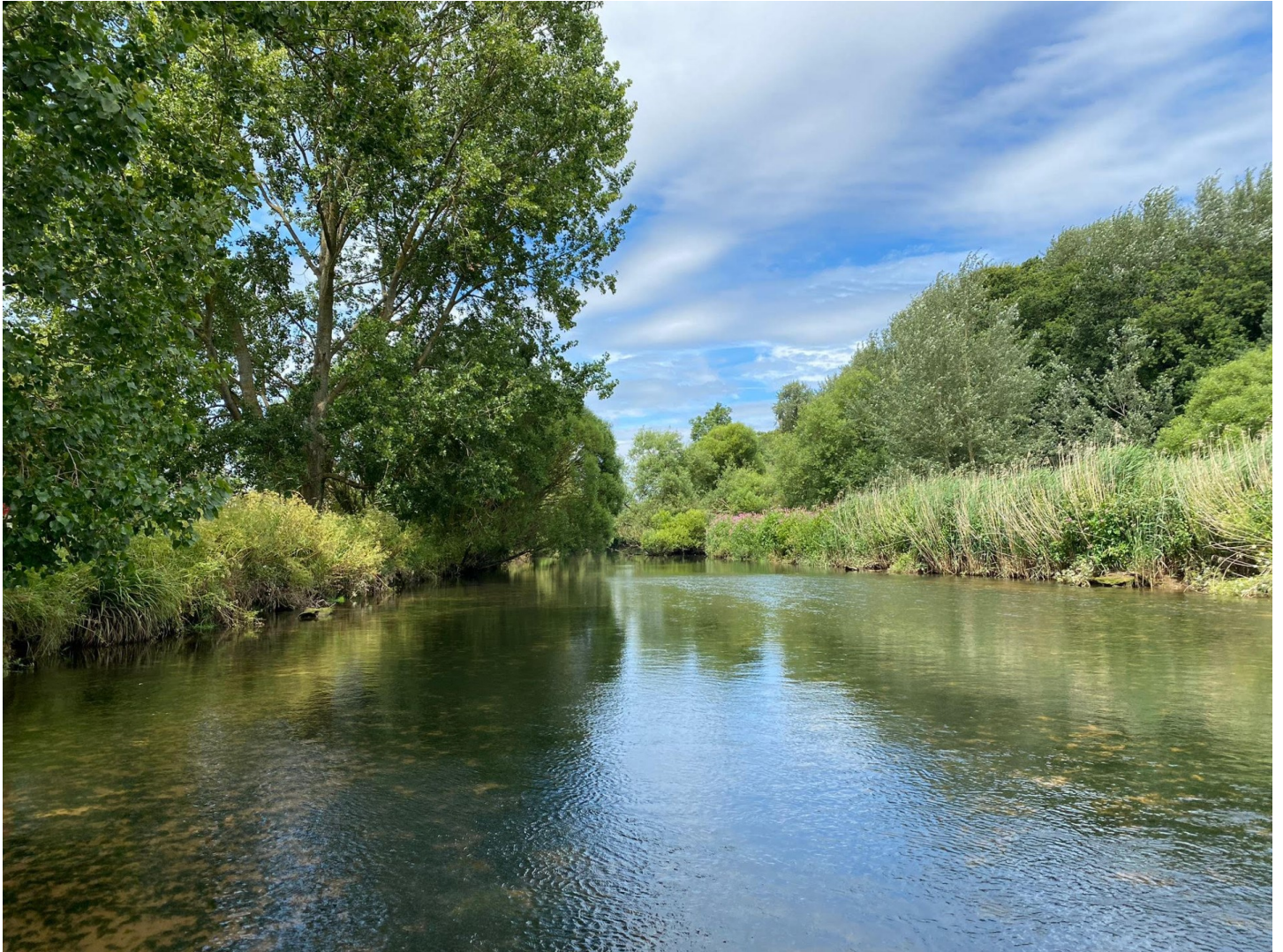
A tranquil stretch of the River Otter