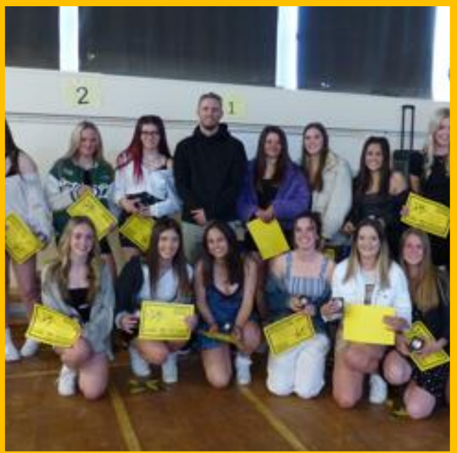
Full Colours Girls