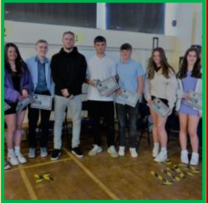
All Young Ambassador nominated