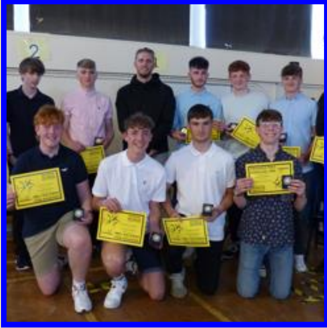
Full Colours Boys