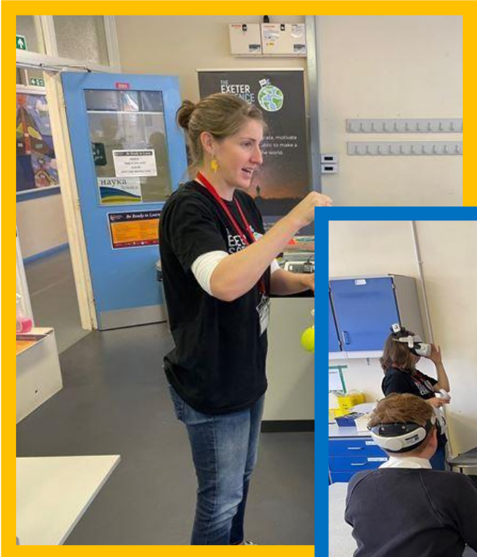
A journey through space and time was enjoyed by the 14 year 7 students who attended the Exmouth Community College 'Space Day' on Wednesday 29 th June.